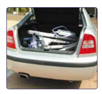
Fits neatly in the boot of an average family saloon car.