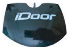
Microwave motion sensor x 2