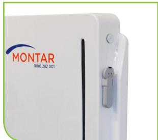
Remote Infra red handset