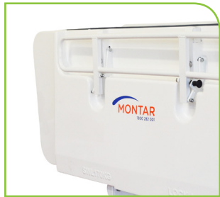
Folds up for space saving