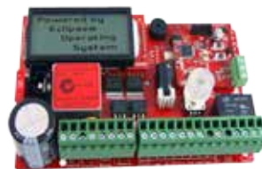
Control card with Eclipse® Operating System