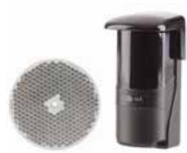
Long range reflector type photo electric beam