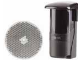
Long range reflector type photo electric beam