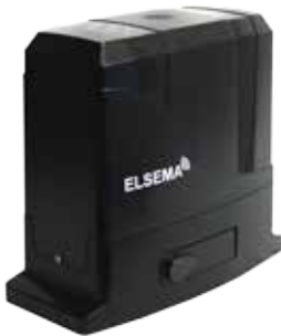
iS600 sliding gate motor