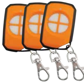
3 x Keyring remotes with frequency hopping