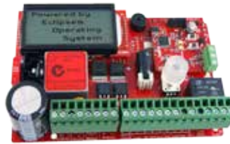
Control card with Eclipse® Operating System