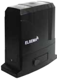
iS900 sliding gate motor