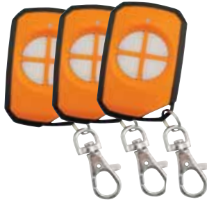
3 x Keyring remotes with frequency hopping