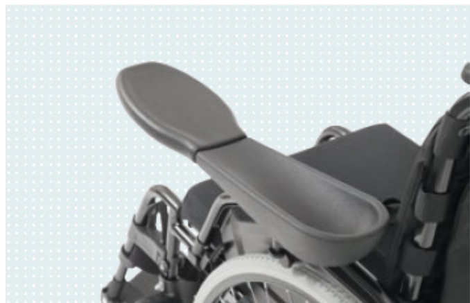
Armrest with swivel unit