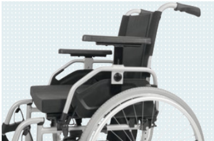
Side panel with height-adjustable armrest