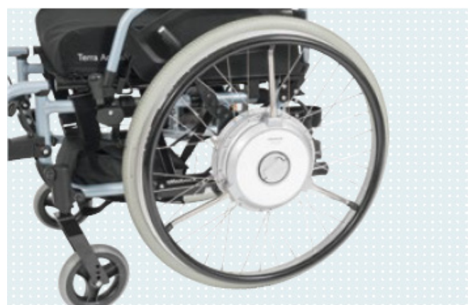
Add-on drives (i.e the new eSupport)