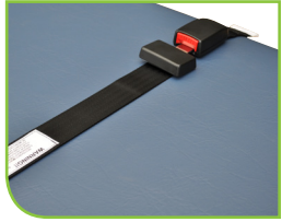
LAP/B Lap Belt