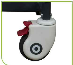
125mm Braking Castors