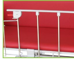
380VRKCT Side Rails