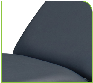
Vinyl Top Colour - CHARCOAL