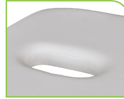
FH Face Hole