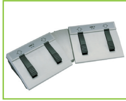
FC-3250 Foot Control FC-3250/2 Foot Control