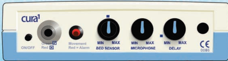
To 3rd party alarm device eg. nurse call system