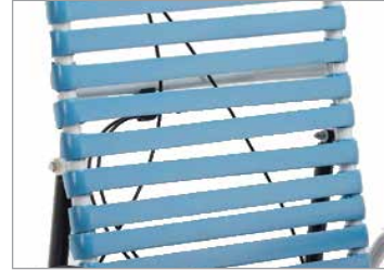
Individualized fit for superior comfort