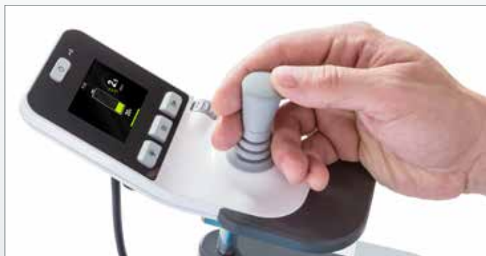
Informative colour display and user-friendly control elements