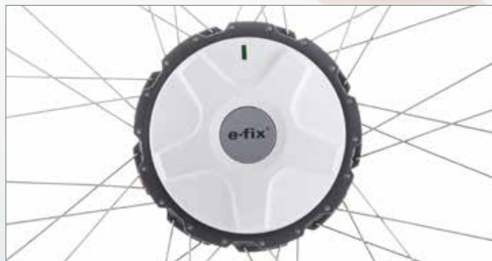
Compact, light, powerful: the e-fix drive unit