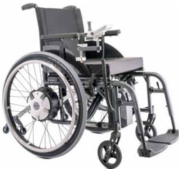
e-fix E36: powerful drive wheels with more power (optional)