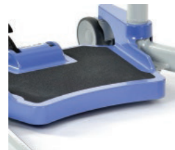
CONTOURED BASE FOR CLOSER ACCESS AROUND TOILET BASES