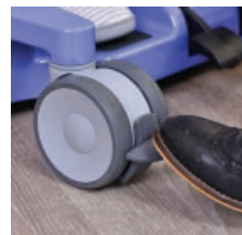
CASTOR MOUNTED BRAKES FOR EFFORTLESS BRAKING