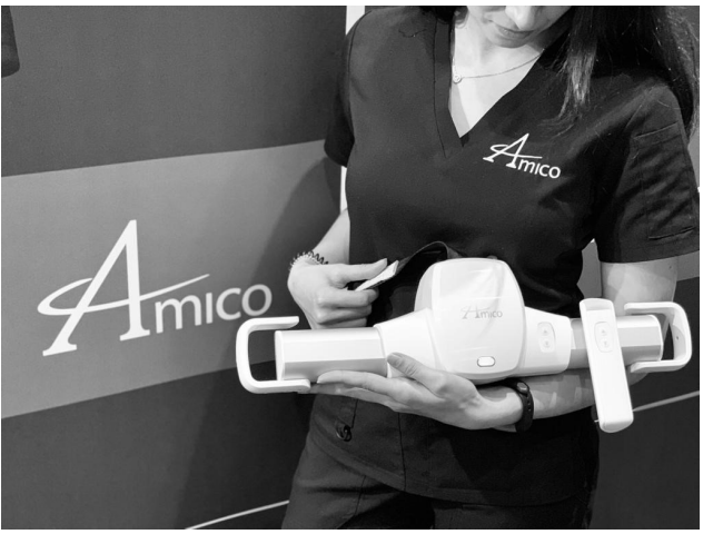
Oltra lightweight just 2.7Kg Powerful 204KG capacity Durable all metal gears Powerful high capacity batteries Fast operation: 5.08 cm/sec no load 3.8 cm/sec 68kg 2.54 cm/sec 204kg