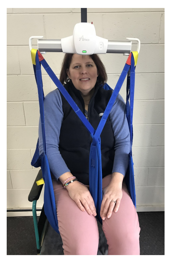
Wide carry bar with simple secure sling attachment.

Introducing the exciting, innovative Amico GoLift Portable that sets new standards for portable patient lifters.