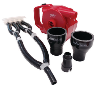
Fast Inflation/deflation pump

Setup or deflate mattress in under 2 minutes