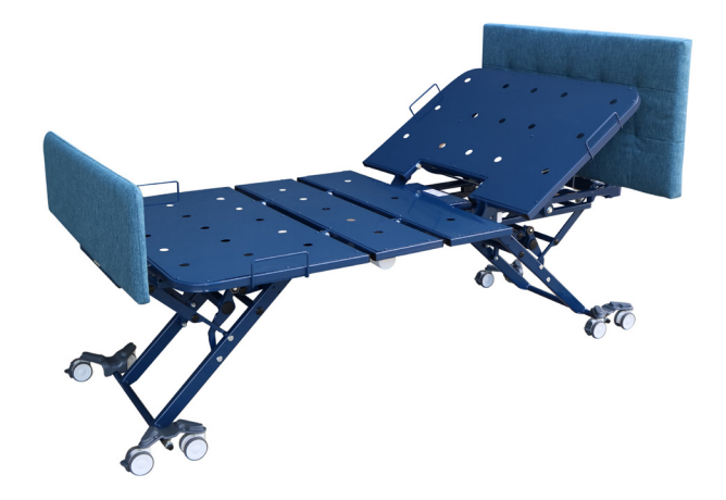
CPR Attendant Control Backrest