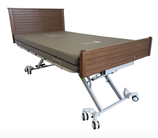
Timber Laminate Upholstered Jersey Headboard & Eltham Style Slender Arch Style Plain Footboard Natural Oak Burnt Walnut Ash Beech Ocean